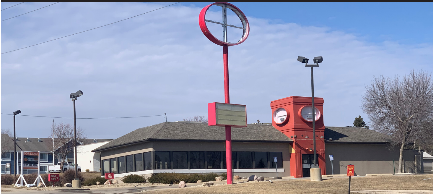
5550 Hwy 52 North • Rochester, MN